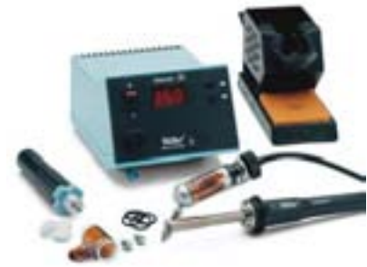
WDD 81V desoldering station