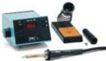
WAD 101 hot air station

demanding rework/repair task. For full details of connecting tools, tips, nozzles and accessories, refer to the latest CooperTools Electronics Price List.