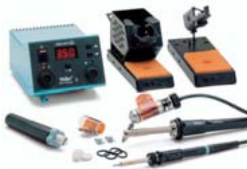
WDD 161V rework station