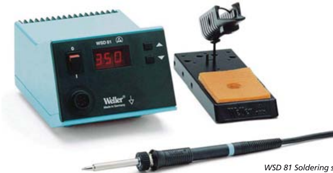
WSD 81 Soldering station